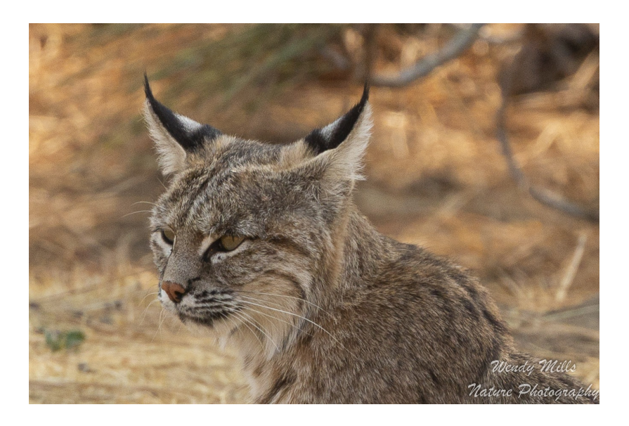
Along with a distinctive bobbed tail, bobcats' ears are also striking - the backs have two white spots which may help kittens to follow in dim lighting and may help to scare off predators since the spots look like eyes. Bobcats have excellent hearing!