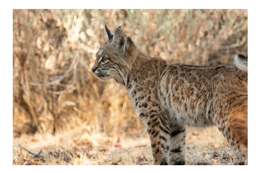
A bobcat can be so fast...and also so still. Here a bobcat pauses briefly before moving on.

importance of solitude and inner wisdom. They remind us that there can be power and strength through silence.