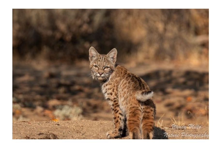
I had the privilege of photographing this stunning bobcat who turned to me with a mysterious gaze.

As we move into a season of celebrations and of giving thanks, I am delighted to celebrate with you the beauty of the bobcat (Lynx rufus), a medium sized wild cat that ranges from Southern Canada to Central Mexico. The bobcat has an average lifespan of 7 years but the oldest known captive bobcat lived to 32! These gorgeous animals are thought to have evolved from the Eurasian Lynx. Bobcats live in all types of terrain wetlands, mountains, forests, and deserts. Their population is fairly stable, although declining in some places, with threats that include urbanization and hunting. They are elusive and most active during the twilight hours of the day.